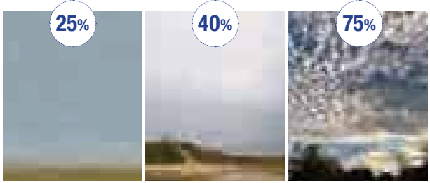
Rainy day U

You can wear clear lenses under all weather and always protect yourself from harmful light.